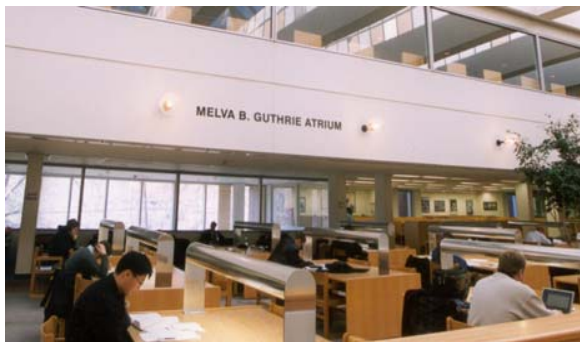
The Melva B. Guthrie Atrium in the Morris Library at the University of Delaware