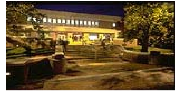
The Morris Library is centrally located on the University of Delaware campus in Newark, Delaware.